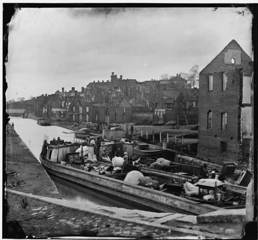
A Southern town after the Civil War